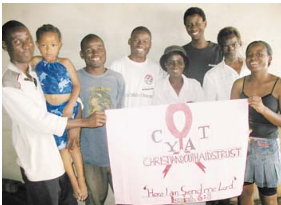
Young people who participated in this pilot in Zimbabwe said they now had increased hope for the future.

An understanding of God's original intentions for the partnership between men and women has helped transform relationships. Participants have been given a positive motivation to challenge and change their own attitudes and behaviour, and realise their ability to transform their own culture.