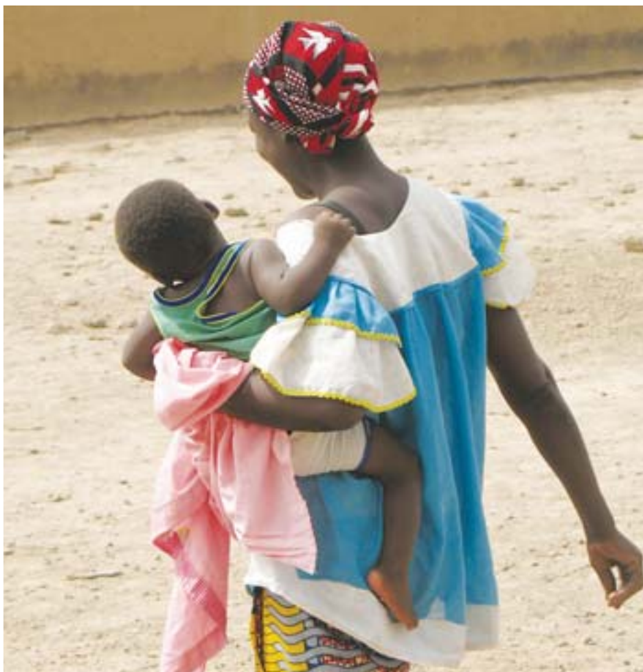
Gender inequalities can put women and girls at increased risk of HIV infection.

Both organisations began by holding initial training sessions to discuss the issues with local church leaders. They were key to ensuring access to the church and the engagement of the community,