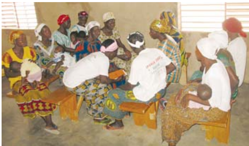
Good facilitation is essential to help groups discuss controversial issues.

couples who participated. Talking about sex in a positive way, as a gift from God for both husband and wife to enjoy, has improved couples' relationships. It has also empowered women to have more say in their relationship and be able to negotiate, refuse or initiate sex which, in some cultures, is seen as taboo. Participating in the programme has also enabled couples to talk about otherwise taboo subjects – such as condom use in the context of their relationship