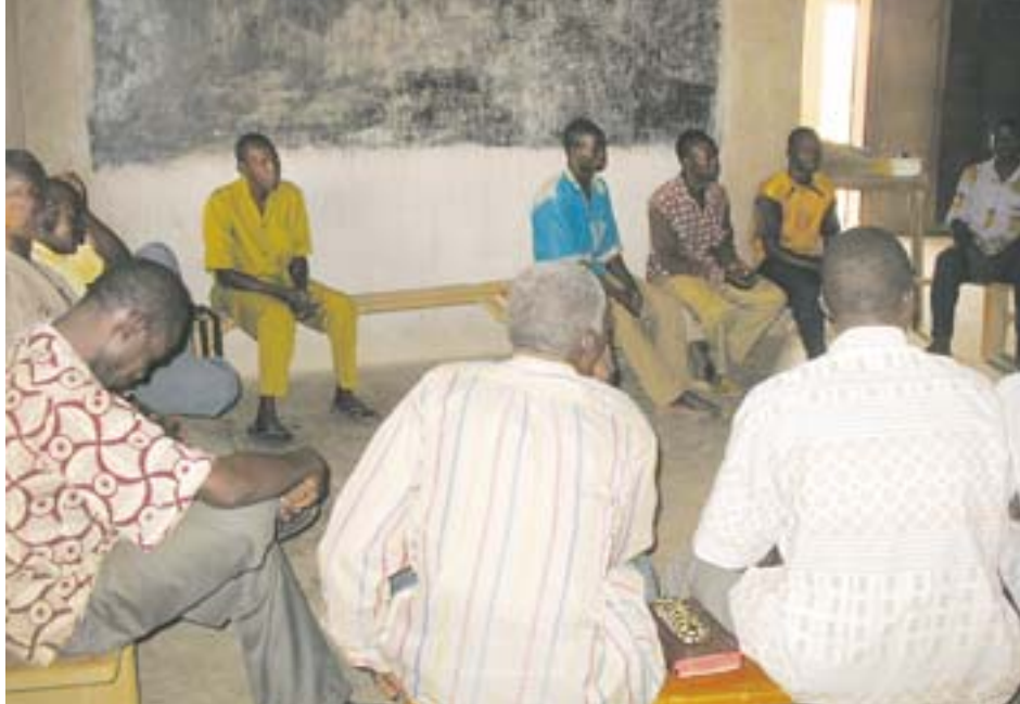
Group discussion during one of the workshops in Burkina Faso.

and in encouraging their congregations in the longer term to put into practice what they had learned. Attendance at workshops was higher when the church leaders invited people, reflecting the position of respect they hold in communities.