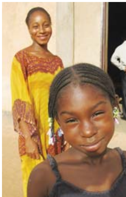
How do social stereotypes affect how boys and girls are brought up?