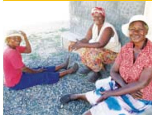
Above: Participants in Zimbabwe.

Tearfund is a Christian relief and development agency building a global network of local churches to help eradicate poverty.