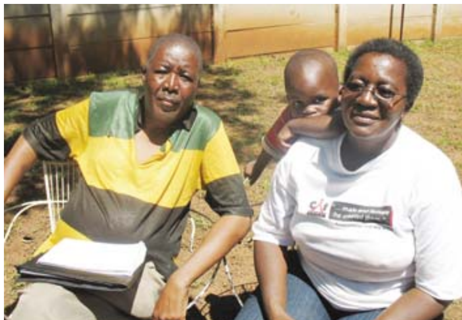
Couples who participated in the pilot project said they had a better relationship as a result.

agency could be seen as patronising or paternalistic.