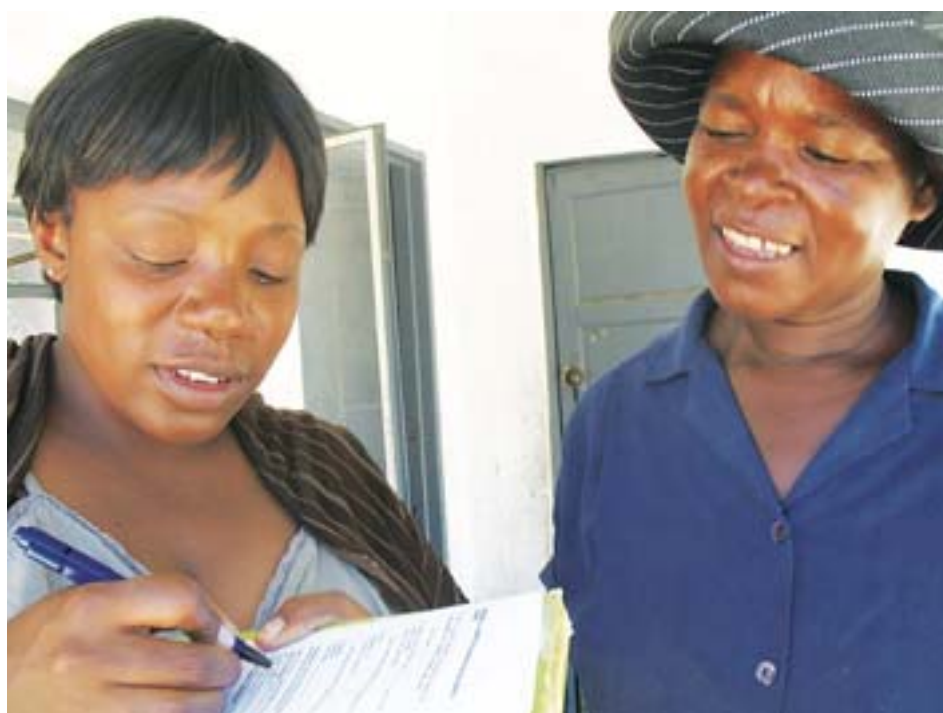
For many participants, the realisation that gender roles can and do change was transformational.

Basic relationship training , including discussing issues of parenting, communication, sex and conflict resolution, has improved relationships among the